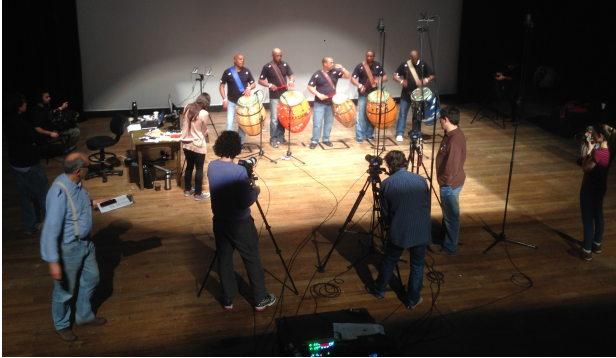
Figure 1. Stage outlook during a five-drum performance.