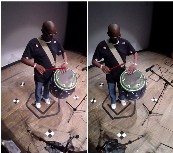
Figure 3. Matching frames of the stereo recording pair.