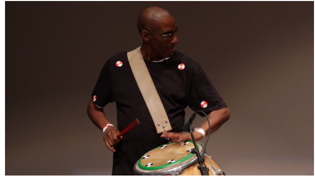
Figure 2. Video framing examples, a wide shot of the ensemble (left) and close-up view of the repique performer (right).